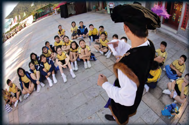
「翱翔」藝動沙螺灣 Flight 2018