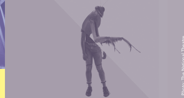
Chinonyerem Odimba (倫敦 London): The Sweetness of a Sting

「青年專屬劇目」致力推動文化交流，培養本地譯者和新銳作家，把劇作家、翻譯、導演和協作人聯繫起來，為年青人創作優質的翻譯或原創劇作。優秀作品將在讀者劇場及將來「戲遊人生計劃」中一一躍現。